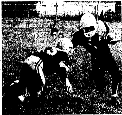
NOT MUCH OF A GAIN — A Farmington Rockets team member stops a Dearborn Mustang cold in his attempt to pick up some ground yardage during Saturday's opener in the Jack Lowther Football League season. The Rockets won the game 18-6.