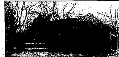
DRAMATIC HOME - LAKEFRONT SETTING. 5 doorways to huge deck, exceptional master suite with library, skylights and balcony. Approximately 5500 Sq. Ft. of outstanding quality and gracious living. Call 644-6700. 70738 DSJ