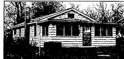
EASY CANAL ACCESS TO MIDDLE STRAITS LAKE! Great boating and swimming. Picture window with great lake view. Partially finished lower level. A great buy at $59,900. Call 626-4000. SEE IT NOW! ADR 65108