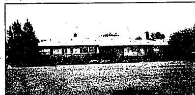
GUNITE POOL FOR SUMMER FUN. This 3 bedroom, one owner ranch has a large kitchen, finished basement, large porch and library. All on a cul-de-sac setting. Near Oakland Hills. $159,500. Call 644-6700. JOS 70870