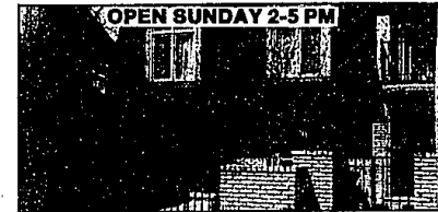
ADAMS WOODS CONDO WITH 3 FIREPLACES. Large deck off living room and master bedroom affords wonderful view of the ravine setting. $184,900. W. off Adams Rd. to 1157 Timberview. ETL 67355