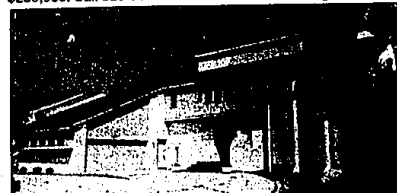
A GARDEN OF PARADISE. Custom 3 bedroom ranch with beautiful low maintenance landscaping, wood decks and a very neutral interior decor which includes a white ceramic foyer. $179,000. Call 644-6700. 67825 KRW