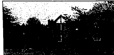
CUSTOM BUILT TUDOR with four spacious bedrooms, library, family room with fireplace, hobby room and a sauna. 1/4 acre treed lot on a private cul-de-sac. Many extras. $239,000. Call 644-6700. LCB 68882