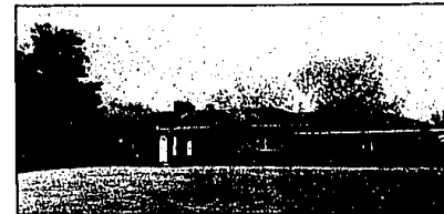
PANORAMIC VIEW FROM THE DECK of this 3 bedroom hilltop ranch. Walk-out lower level, 25' enclosed porch and family room. Nice Bloomfield location. $121,900. Call 644-6700. DSJ 68987