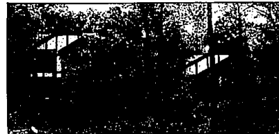
CITY OF BLOOMFIELD HILLS LIVING with a country setting. Gorgeous views from every window of this magnificent Tudor. Florida room, library, family room and finished walk-out lower level. Fabulous jacuzzi. Call 644-6700. JME 69034