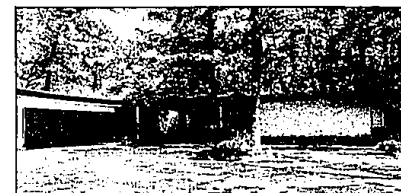
TOTAL PRIVACY IN THE CITY OF BLOOMFIELD HILLS. Home and pool surrounded by natural and wild flowers. Master suite includes library. Large expanses of glass afford beautiful views. $495,000. Call 644-6700. KMW 69150