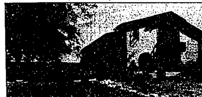
THE PERFECT HOME for gracious living and entertaining. A dramatic setting on a beautiful 2 acre lot. Walnut Lake privileges for swimming and boating. Walk-out lower level. 25'x20' deck. $285,000. Call 626-4000. RLY 68848