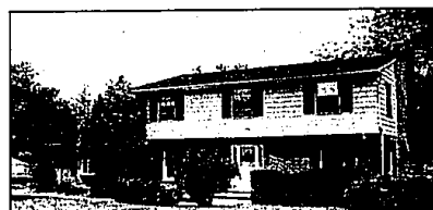
POPULAR HICKORY HEIGHTS. Large master suite is one of 4 bedrooms. Extra's include a fireplace family room, Florida room and private rear yard with in-ground pool. 2 fireplaces. $169,500. Call 644-6700. LNB 70859