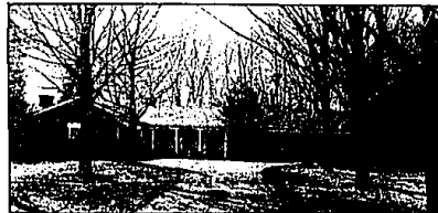
GREAT FOR ENTERTAINING. Fireplaces in the large family room, master suite and living room. 27x12 Florida room and 17x11 dining room. Park-like yard. In Gilbert Lake area. $174,500. Call 644-6700. GSD 65800