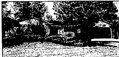
SPACIOUS ADJOINING LIVING AREAS in this well decorated 3 bedroom ranch. Custom, kitchen, 2 fireplaces and a pretty treed setting. BLOOMFIELD HILLS SCHOOLS. $129,900. Call 644-6700. SPP 67878