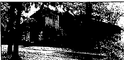
NORTH OAKLAND'S MOST DELIGHTFUL RETREAT. Authentic country contemporary chalet on 5 acres with Paint Creek frontage. 2 story family room, 3 bedrooms and breathtaking views. $169,500. Call 644-6700. EKM 68842