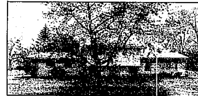
LAKE ACROSS STREET with boating and swimming privileges available to the owners of this interesting home. Family room with fireplace. 160' lot with view of the lake. EASY TERMS. $84,500. Call 626-4000. AWR 64888