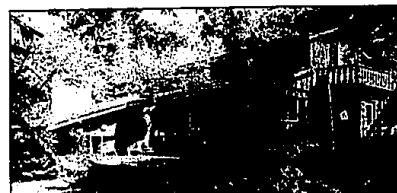
COUNTRY ESTATE with lots of charm and character. 16 acres on private stocked lake. Large, 16 stall stable, tack and hospitality room and workhouse suitable for caretakers quarters. $259,900. Call 623-7800. R-1112