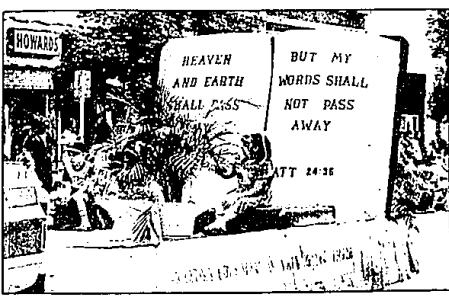
Floats were a part of the festivities at Saturday's parade in downtown Farmington.

It just wouldn't be a festival without a parade. The parade down Grand River Avenue was a highlight of the 21st annual Farmington-Farmington Hills Founders Festival. The parade, held Saturday morning, included a variety of floats, clowns and entertainment. Although the sky was cloudy, it didn't rain on the parade. The weekend festival activities marked the end of a busy week in the Farmington area. Other events included Kids' Day, the pet show, the Miss Farmington scholarship pageant, arts and crafts exhibits, and sidewalk sales.