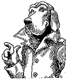
McGruff, crime dog.

Remember, a house clearly visible to you, your neighbors or the police is a definite deterrent to a perspective burglar. You may have to sacrifice a bit of your privacy but you can decisively minimize your risk of becoming a crime statistic. Oftentimes, the simple solutions, such as those listed above, can be the most effective.