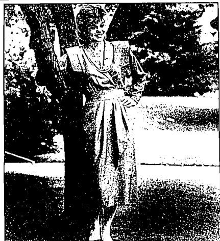
It is with distinct pleasure a new women's apparel shop is presented to you...