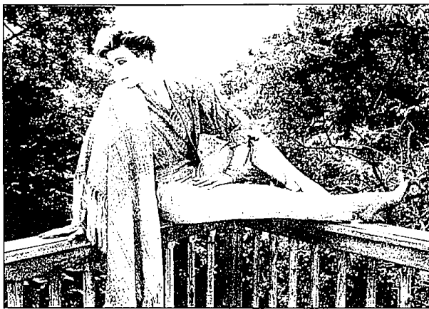
Shades of marigold, pink and iris are woven together by designer Zonda Nellis to create a tie-back hip sweater, roll sleeve, three-quarter length coat and

You are looking for sporty glamour this fall, a casual, elegant, in-the-know way of dressing that shouts its own message — cool confidence.