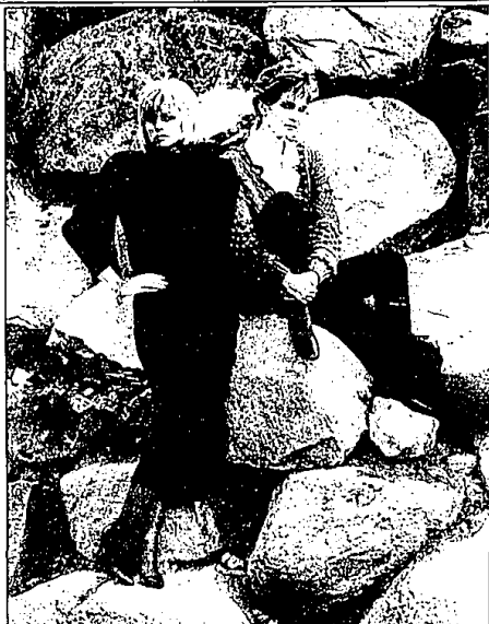
The versatility of sweatering, as in black wool knit jersey sweater, $210, with matching sarong skirt, $220. By Anne Klein. At right, raspberry, hand knit wool sweater, $250, over white silk, knotted collar shirt, $190, and black, wool jersey pant, $75. By Perry Ellis. Saks Fifth Avenue.