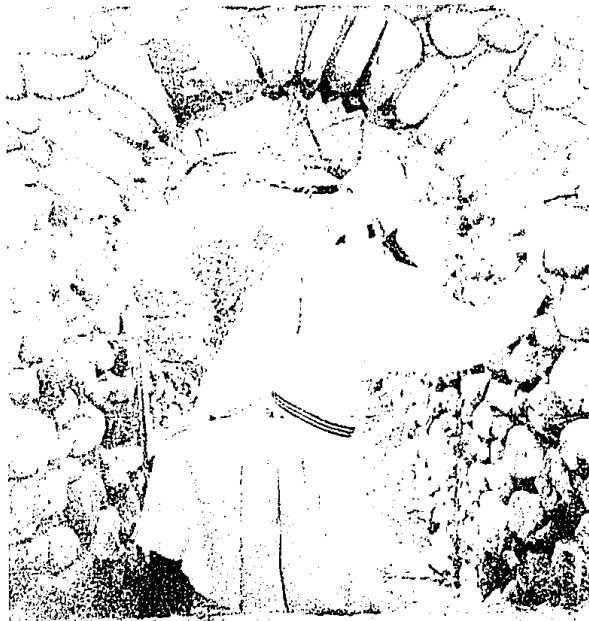
Dusty pink wool and angora sweater, $865, and skirt, $590, softly shapes a new approach to Fall. The skirt is dusted with rhinestones, and the sweater is sparkled

The shapes and colorations of the season are luxe, winking out a message that says "I am rich" as lights dance on this brilliant palette of colors.