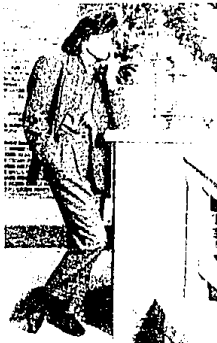
Pattern on pattern in a mix of jade green bold plaid and paisley. Jacket, $130; pant, $70; skirt, $80. By OCCO. Hudson's.