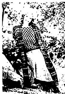
Multiple colors mix beautifully in a rainbow of separates from French Rags. Serape, $196; top, $188; skirt, $198. Bonwit Teller, Somerset Mall.

"The" Durrier for Honesty and Reliability