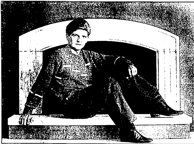
Gray and black sweater with yellow horizontal accents, $65, is worn over charcoal gray, double pleated cotton trousers, $110. These and other designs by Giorgio Armani at L'Uomo Vogue.