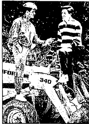
Tomato red, heavy cotton knit exercise suit (left) is accented with diagonal ribbing on the front, $150. L'Uomo Vogue. Navy cotton sweat pant, $75, with white striped rugby shirt, $70, are Polo label by Ralph Lauren. Carl Sterr.