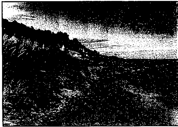
September is one of the best times of year to enjoy Michigan beaches. Solitude and serenity are available and the weather

EXPO '86 — Opening in Vancouver, B.C., on May 2, 1986, is at the ticket-selling stage. Tickets are