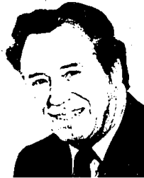
John Portman Jr.