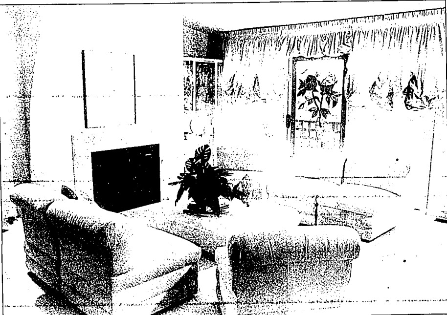
The soft window treatment sets the stage for the dominant role played by the stained glass work with its brilliant primary colors. Using chairs rather than a sofa builds a lot of flexibility into the room arrangement.