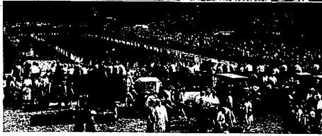
MORE THAN 300 antique automobiles will be featured at the 20th annual Greenfield Village Old Car Festival Saturday and Sunday, Sept. 12 and 13. Steam, electric and gas-powered autos built between 1898 and 1925 will participate in games, parades and contests. Some 40,000 old car buffs are expected to attend.