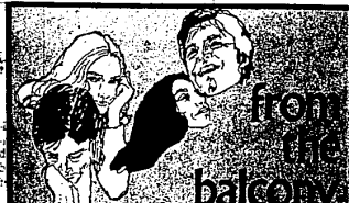
Films listed in this guide are showing at area theaters. Check the theater listings for the specific theater and time of showings.

HELPFUL HINT: When frying things that splatter, bacon, chicken, etc. Invert a colander over the frying pan. Heat escapes, but the fat doesn't.