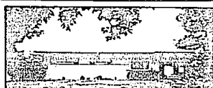
BROCK 4 bedroom ranch. Park-like setting with gazebo. Hardwood floors in all bedrooms. Finished basement. $74,900. 851-1900.