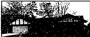
EXECUTIVE RANCH. Beautiful 2 year old custom ranch. Great room and 2 decks for your round dining. Country appointments and neutral color thru-out. $127,500. 477-1111.