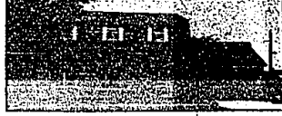
DUTCH COLONIAL. 4 bedrooms, formal dining room, family room with fireplace and doorwall to patio. Good family floor plan, large lot in nice area. $37,000. 477-1111.