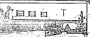
CUSTOM COLONIAL with class begins at the front door. Spacious foyer, paneled library, 1st floor laundry, separate master suite, beautiful family room with fireplace; sprinkling system, professionally landscaped. Priced at $109,000. 659-2200.