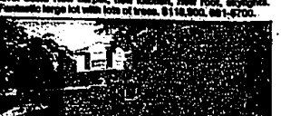
DOWNTOWN FARMINGTON. 4 bedrooms, 2 1/2 baths, in-ground pool, patio and 1 1/2-level deck. Brand new kitchen. All tile in conventional Alta Loma area. $119,500. 477-1111.