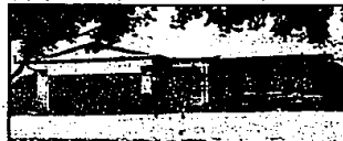
SHARP 3 bedroom ranch on well landscaped lot, country kitchen, family room, Florida room. Possible 4th bedroom in basement. $63,500. 477-1111.