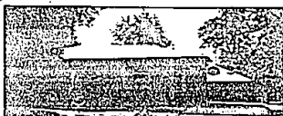
THREE BEDROOM RANCH. Sharp, brick home plus 2 bedrooms in basement finished and carpeted. Large fiberglass covered deck in rear, gas grill plus aluminum sided 2 car garage with opener. $72,500. 477-1111.