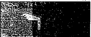
CONV 4828 THIS ONE Charming 3 bedroom ranch providing city living in country setting. 3rd story main. Spacious kitchen, fireplace, paneled den, second car garage. 1st floor sun. $82,500. 599-2200.