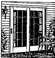
Pella Contemporary French Sliding Glass Door