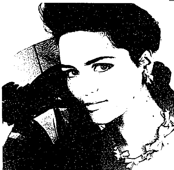
Gold necklace can reflect the twinkling lights of the holiday season.

dresser may prefer gold with Old World charm — a pocket watch with fob, crest or signet ring or traditionally designed cuff links with coins, knots or monograms.