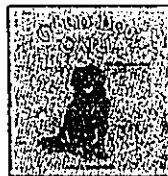
GOOD DOG, CARL by Alexandra Day A delightfully illustrated picture- book of the adventures of a little girl and her canine babysitter.