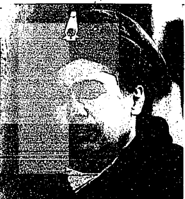
Danny DeVito is back again as a would-be master criminal in the sequel to "Romancing the Stone."

The film has no great philosophy nor any particular message. Just enjoy.