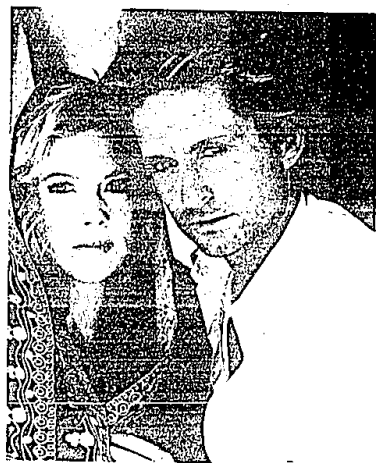
Michael Douglas is adventurer Jack Colton and Kathleen Turner is romance novelist Joan Wilder, who share wild adventures in "The Jewel of the Nile."