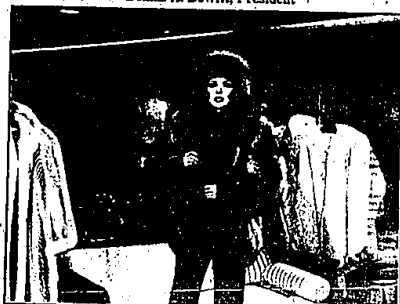
It's an asset for any woman to own a quality fur.