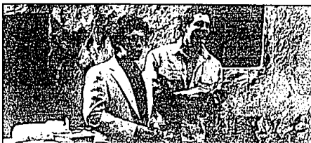
Curtie Armstrong (left), a graduate of Oakland University's former Academy of Dramatic Art, and Steve Guttenberg are fellow students in "Bad Medicine," one of two movie comedies released this year featuring Armstrong in the cast.