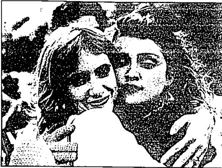
Madonna hugs costar Rosanna Arquette in scene from "Desperately Seeking Susan," the movie released this spring that proved the sexy singing star from Rochester could act, too.