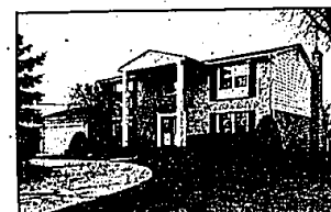
CONTEMPORARY LIFESTYLE? Then this bright, neutral, spacious Southfield Colonial is for you! Four bedrooms, 2 1/2 baths, large family room with fireplace and built-ins plus recently redecorated and meticulously maintained. $99,900. STR-34298