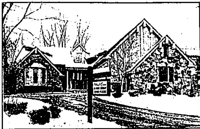
CHARMING CAPE COD - EMPTY NESTER CLUSTER HOME Property adjoins private, quiet 16 acre, secluded nature park. Home features dormers, bay windows, hardwood floors in country kitchen and Great Room with 2 story fireplace plus loft! First floor master suite and laundry room, wood deck, central air and sprinklers. $265,000. VIE-75909