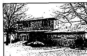
TWYCKINGHAM VALLEY COLONIAL Excellent value at an unbelievable price! Great family room with fireplace. 4 bedrooms, 2 1/2 baths, central air, patio and easy access to shopping. $75,900. BEK-74875