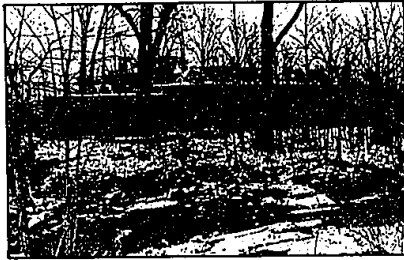
"SECLUDED SETTING" With babbling brook! The serenity of up north is felt in this dramatic contemporary walk-out ranch. Each room presents stunning views and the peaceful sound of running water creates a restful atmosphere in the city. Located in a lovely Farmington Hills area! $229,000. DAS-75764