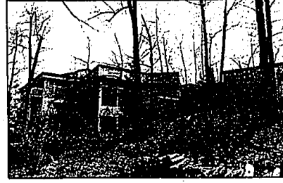
SPECTACULAR CONTEMPORARY Unique home situated on a magnificent wooded lot with stream. Every luxurious amenity including indoor pool, Great Room, 5 bedrooms, 4 full and 2 half baths, photo lab, 5 decks, central vacuum, wet bar, wine cellar and Japanese soaking tub. GOF-64502