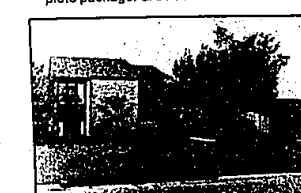
VAULTED CEILING CONTEMPORARY! Dramatic 4 bedroom Southfield home offering family room, paneled den and game room allow room for many activities. Balcony effect foyer and formal dining room overlooks a full brick fireplace Great Room. $219,000. RIW-73768