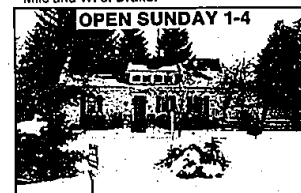
OPEN SUNDAY 1-4 A TOUCH OF COUNTRY Acre and a half, older, updated and heavily treed with greenhouse and pond. Family room with wood burning stove, 4 bedrooms, 1 1/2 baths and new windows in master bedroom. $126,900. 7430 Old Mill. N. of 14 Mile and W. of Lahser.