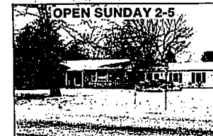
OPEN SUNDAY 2-5 SKATE, SWIM AND SAIL Immaculate ranch on private wooded double lot close to beautiful Wing Lake. Newer roof, central air, sprinklers, neutral contemporary decor and Bloomfield Hills Schools. $109,000. 6336 Thurber. N. off Maple and W. of Telegraph.