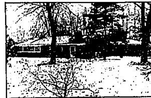
NEW LISTING!! A comfortable 3 bedroom, 2 bath ranch home with fireplace, situated on a gorgeous lot, new kitchen and some new carpets. Bloomfield mailing and Birmingham Schools! $114,900. EAR-65847

All open houses are located in the new Chestnut Run Subdivision of Bloomfield Hills off Hickory Grove, bet. Lahser & Telegraph.