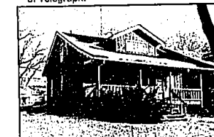
MULTI-FAMILY DWELLING Located in Ferndale. Three buildings each with 2 apartments plus a vacant loft! Total renovation in 1983. Each with 2 stories and basements. Offered at $137,000 for complete package. SAA-75175