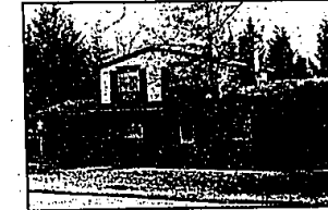
FRANKLIN VALLEY SUBDIVISION Maintenance free Colonial situated on a park like lot with running creek. Living and dining rooms, 3 bedrooms, family room with full brick fireplace and parquet floor in foyer. Priced to sell! $123,900. PEE-34297