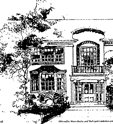
Offered by: Morris Realty and Michigan Condominiums

Model Open Daily and Weekends: 1 to 6 p.m. Closed Thursday 855-1066 (Model) or 626-2590 (Office)