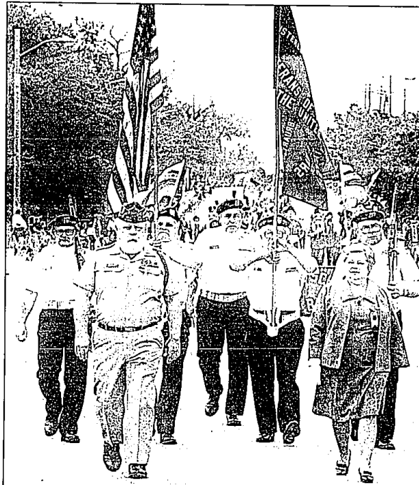
The Veterans of Foreign Wars Farmington Post 2269 Color Guard led the parade procession along Grand River from Orchard Lake Road to the War Memorial.

"I fought for my country," he said. "I'm proud to be back, and proud to be marching in the parade today."