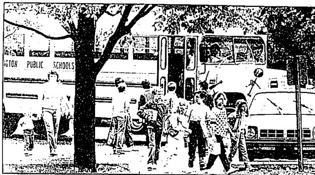
William Grace students arrive for the first full day of school.