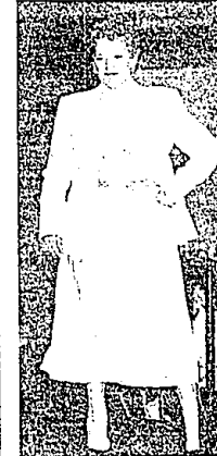
Timeless designs with town and country chic are worn by Cheryl Azar (at left) and Grace Buhlman. There is not much mix and match at Talbots. Three pieces are generally sold together as one outfit.