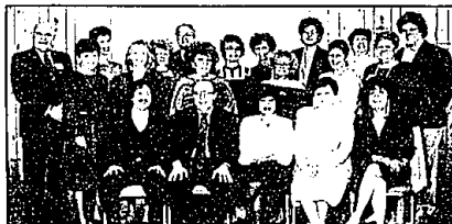
LATHRUP VILLAGE OFFICE