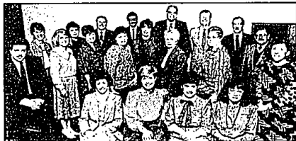
ROYAL OAK OFFICE