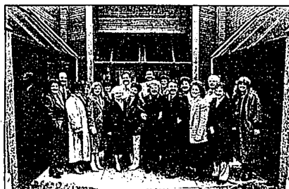
WEST BLOOMFIELD OFFICE