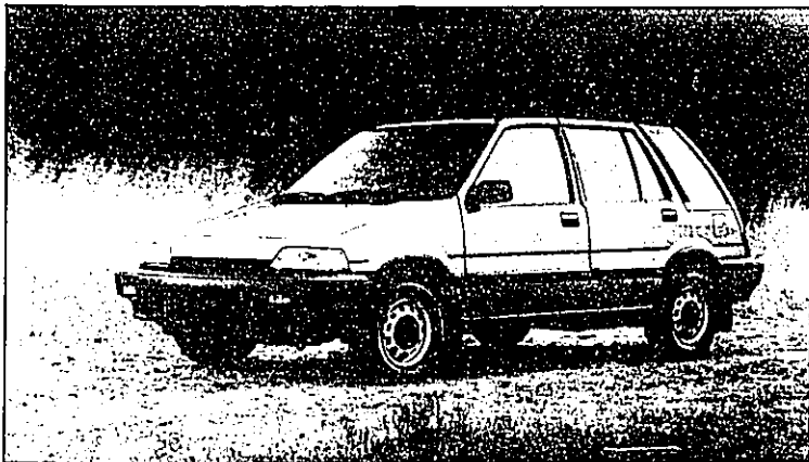
The Honda Civic 4WD wagon for 1987 boasts a Real Time system that "thinks for itself." The system incorporates a viscous coupling in the power train that automatically senses when the front wheels begin to lose traction on a slippery surface and automatically engages the rear wheels, providing the maximum traction of 4-wheel drive. When the wagon is back on a dry surface, the system shifts back to 2-wheel drive. There are no buttons or levers for the driver to operate.