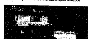
IMMACULATE COLONIAL, 4 bedrooms, 2 1/2 baths, family room with natural fireplace, beautiful kitchen, finished basement. Set on half acre. 2 car attached garage with door opener. $79,500 659-2300