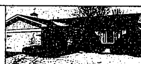
INVEST IN LIVING - relax and enjoy, love living in this immaculate, easy flowing ranch. Don't have to do anything except move in. $76,500 651-1900 (THO)