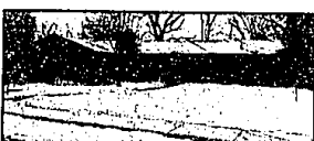
ALTA LOMA RANCH, Updated and improved. Much large family room than usual. Lots of new windows, ceramic tile and modern kitchen. "Must See" $117,600 651-1900 (ALT)