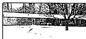
EXECUTIVE RANCH, You will surely fall in love with this very special 4 bedroom home. Nearly 2 acres of beautiful property, completely updated! Quality throughout! $109,000 651-1900 (GPR)