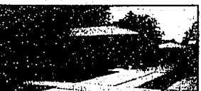
HEAT & BEDROOM RANCH in beautiful Farmington Hills neighborhood. Full basement, central air, neutral decor, fenced yard, deck, 2 car garage. $71,900 477-1111