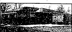
THREE BEDROOM RANCH WITH HARDWOOD FLOORS, 1 1/2 baths, ceramic tile in kitchen and bath. Lovely family room in rear. Patio and fenced backyard. $50,600 477-1111