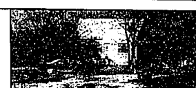
LAND CONTRACT TERRACE, 8 heavily wooded acres highlight this rustic 4 bedroom bungalow with room to expand. Fully fenced yard. $94,500 348-6430