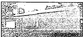
NEWER BRICK RANCH, 4 years old on large lot. 3 bedrooms, 1st floor laundry, fireplace and 2 car attached garage. Move-in condition. Immediate Occupancy. $99,900 477-1111