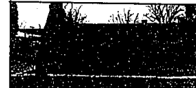
YOU MUST SEE THIS sharp 3 bedroom, 1 1/2 bath brick ranch with cathedral ceiling, open floor plan with new carpeting in living and dining room. Lots of storage. $42,500 659-2300