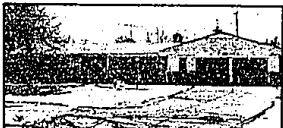
DOWNTOWN FARMINGTON, Desirable 3 bedroom ranch in Alta home subdivision. Natural fireplace in living room and family room. Screened porch, central air. Immediate Occupancy. $115,000 477-1111