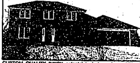
CUSTOM QUALITY BRICK colonial in Independence Hills, 3 bedrooms, 2 1/2 baths, fireplace in family room, Roman tub in master bath. Endless list of amenities. $229,000 651-1900 (RUT)