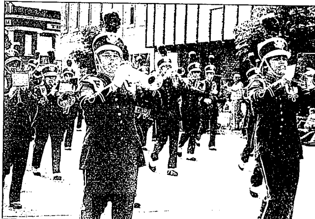
The Farmington High School Marching Band provides its brand of musical entertainment.