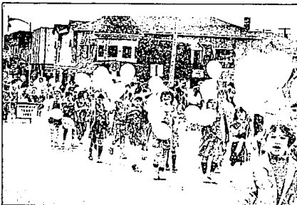
With helium-filled balloons in hand, Brownie Troop 3166 makes it way up Grand River.