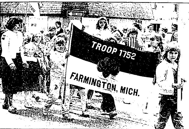
Girl Scout Troop 1752 of Farmington displays its banner proudly as it marches along the parade route.