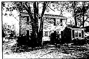
SOUTHFIELD - NEW LISTING Affordable country living. Easy access to expressways and shopping areas. Nice colonial on large trend lot with perfect floor plan including living room with natural fireplace, dining room, family room and super 4 car garage. $67,500 (W-207) 851-4400