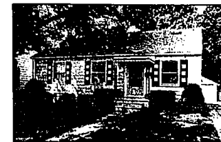
ROYAL OAK RANCH If kitchens are important how does 19x11 sound with 19 feet of cupboard and counter top, 3 bedrooms, 3 bathrooms, air and furnace, well decorated, maintenance free exterior, full finished basement, motivated seller. $88,900 (LD-121) 647-6400

BIRMINGHAM : ROYAL OAK 647-6400 547-2000