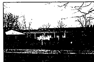
FARMINGTON HILLS - JUST REDUCED Briar Hill spacious ranch on lovely large lot featuring 3 bedrooms, 2 full baths, large family room, formal dining room, natural fireplace in living room, finished basement and attached garage. $119,900 (B-295) 851-4400