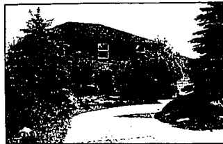
SPECTACULAR LAKE FRONT PROPERTY WEST BLOOMFIELD - 4 bedroom colonial featuring 420 sq. ft. sunroom overlooking the lake. Plush carpeting, updated kitchen, 1st floor laundry, NEW heating and cooling system, finished walk-out basement, attached garage and walled-in deck with steps leading to PRIVATE Woodpecker Lake. $249,900 (GE-983) 557-6700