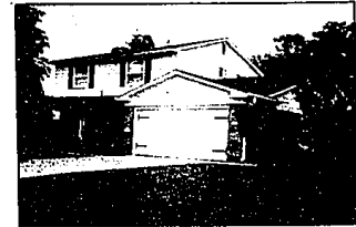
LATHRUP VILLAGE BEAUTY Attractive 3 bedroom 2 1/2 bath colonial offering central air, spacious kitchen with breakfast room, rare ENERGY EFFICIENT FIREPLACE in the family room, finished basement, patio and professionally landscaped lot. $88,500 (LD-121) 647-6700