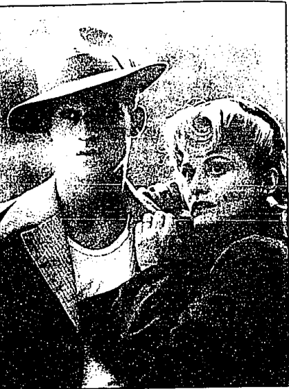
Patrick Dempsey plays legendary ladies' man "Sonny" Wisecarver, and Beverly D'Angelo is an older woman who falls for him in "In the Mood."

"Robocop" (B) (R) 110 minutes Interesting film about corporate struggles to mechanize police forces of the future. Detroit, as usual, gets bad rap as crime capital. Excellent performance by Peter Weller in title role but film is longer than it needs to be and is marred by excessive violence. But, hey, that's life.