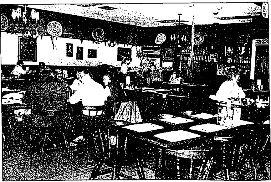
The family-owned Mexico Inn in Westland shows the extra care and attention of the owners — from the clean surroundings to the very gracious waitresses.

The No. 2 combination plate ($8.95) provided a sampling of other Mexican dishes: a taco that had a tasty shell and fresh ingredients; a tinga which was spicy and unusual with a great guacamole topping. After eating these and getting filled, we had difficulty even trying the burrito and enchilada, but both tasted very good, even reheated the next day. ENTRÉE, VEGETABLES AND GARNISHES — 30 points maximum. Points awarded — 26.