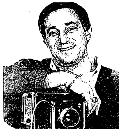
Photographer Monte Nagler took the highest arts honors the two cities can bestow when he was named Artist-in-Residence for 1987.