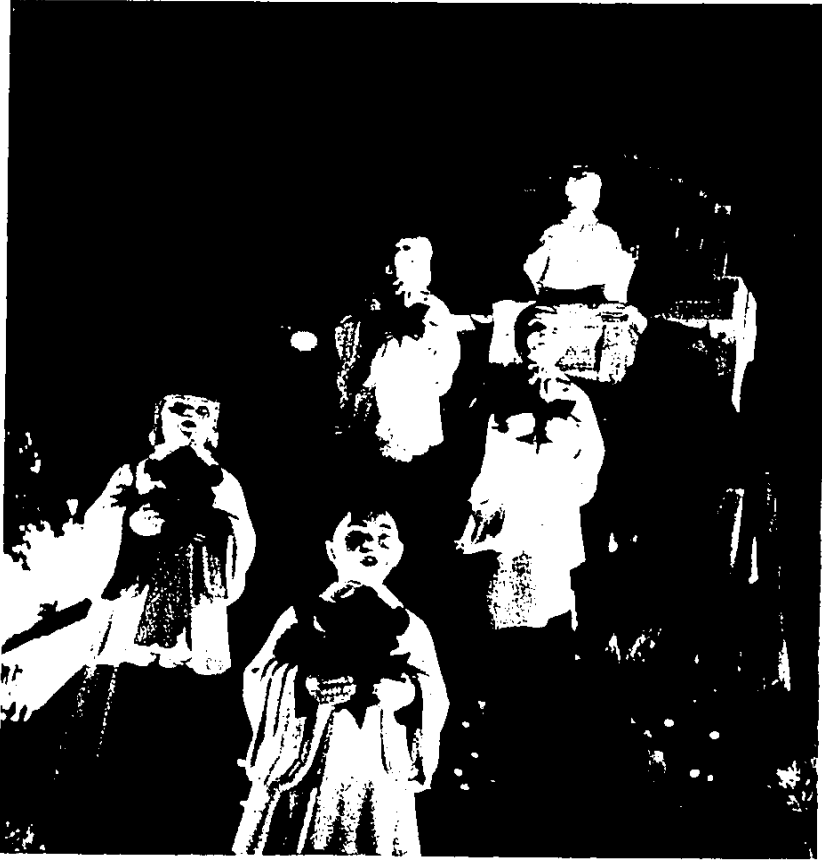
BUILT OVER THE Kellogg Park fountain, this colorfully lighted exhibit shows carolers and an organist and sends forth recorded music of the season. It is one of many items which turns Plymouth into a Christmas fairyland.