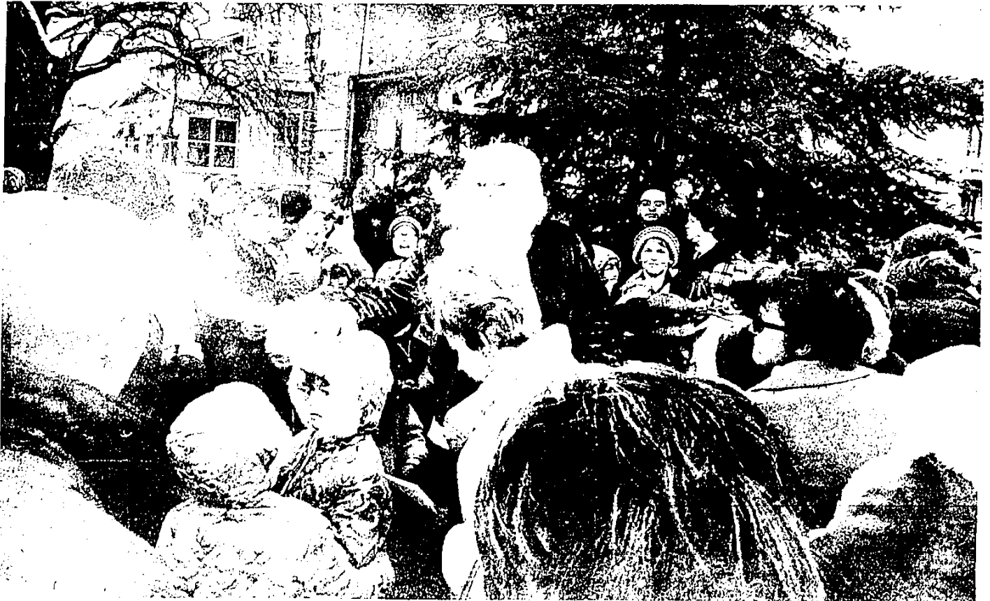
OLD VILLAGE youngsters and parents give Santa a jolly welcome as he pays annual visit.