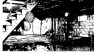
BEFORE - this unfinished basement became quaint ski retreat in following pictures. Approached with creative verve, even ugly Lally column (steel pole) succumbed to clever remodelers, who painted it red and adorned it with decals from ski resorts.