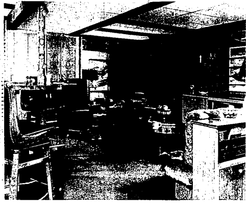
RED INDOOR-OUTDOOR carpet, weathered-looking wall paneling, and acoustical suspended ceiling make attractive room surfaces. Note pegged and lacquered poster for stacking skis at right and curtain treatment that adds deep false window and preserves source of light.