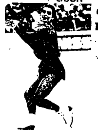
Katarina Witt East Germany