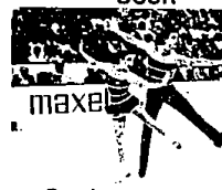
Gordeeva and Grinkov USSR