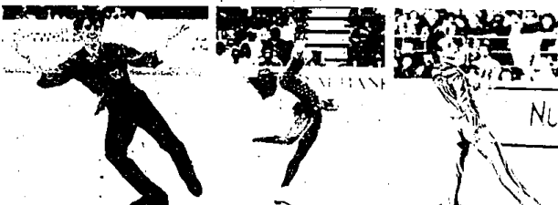
Brian Orser Canada

Cast of skaters may change due to injury or other unforeseen circumstances.