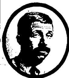
The Full Moustache