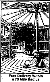
Free Delivery Within a 70 Mile Radius

Family Owned, Owned & Managed Since 1948 H.A. SMITH LUMBER & SUPPLIES, INC. 28575 Grand River Avenue near Middlebelt Farmington Hills 474-6610 Where Your Business is Appreciated All Strangers Are Only Friends We Haven't Met Hours: Monday - Friday 130 - 5:30 Saturday 8:00 - 4:30