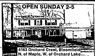
OPEN SUNDAY 2-5 4163 Orchard Crest, Bloomfield N. of Maple, W. of Orchard Lake

IMMACULATE! Move-in condition! 4 bedrooms, 2½ baths with finished basement. Living room has fieldstone fireplace and bay window. Family room with fireplace, beamed ceiling. Updated kitchen, formal dining room. Professionally landscaped. $179,900. 647-0500 or 647-8440. STEVE MITCHELL.