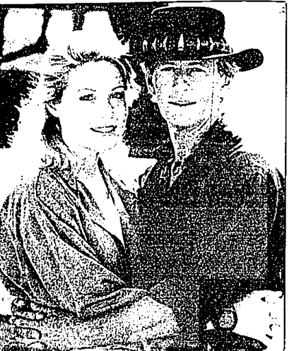
"Crocodile Dundee II" features Paul Hogan as the adventure-some Michael "Crocodile" Dundee and Linda Kozlowski as newspaper reporter Sue Charlton.

"Shakedown" (D+) (R) 90 minutes. Colorful dialogue is good for a few