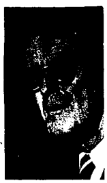
SEN. PHILIP HART (Dec. 10) is Sagittarius, which figures to be compatible with a liberal. With a zero rating on the conservative index, Hart ranks as the most liberal member of the Senate.

IN THE OBSERVER Newspapers study, one part of the team looked up the birthdates of 200 members of the 91st Congress from signs selected at random; then looked up their zodiac birth signs and their ACA ratings.