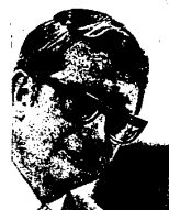
REP. MARVIN ESCH (Aug. 4) is Leo, which is politically the most liberal sign. With a 43 lifetime record on the index, Esch ranks as the second-most liberal Republican from Michigan.