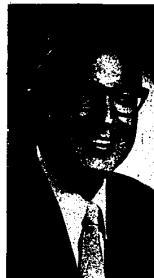
REP. WILLIAM D. FORD (Aug. 6) is Leo, the most liberal category politically. Ford gets consistently low scores from conservative groups and ranks as one of the most liberal members of the U.S. House.