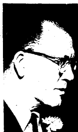
SEN. ROBERT GRIF-FIN (Nov. 6) is Scorpio, the most complex and baffling of the signs but clearly a conservative. A supporter of the Nixon Administration most of the time, Griffin scores a 52, moderately-conservative.

Yet if astrology's theories are rubbish, its predictions are not. Astrology is like the herbs that the medicine man picked up on the hillside. For reasons unknown, the things work. They don't work perfectly, but the results still can't be attributed to mere chance.