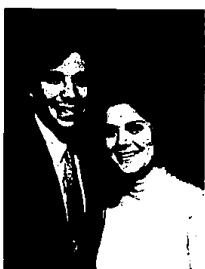
the couple will reside in Chengdu, People's Republic of China.

A garden reception was conducted at the home of the groom's parents. After a wedding trip to Hong Kong,