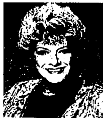
Rosemary Clooney, a graduate of Mercy High School in Cincinnati, Ohio, comes to Detroit to establish the Rosemary Clooney Friendship Fund for Mercy High School in Farmington Hills.