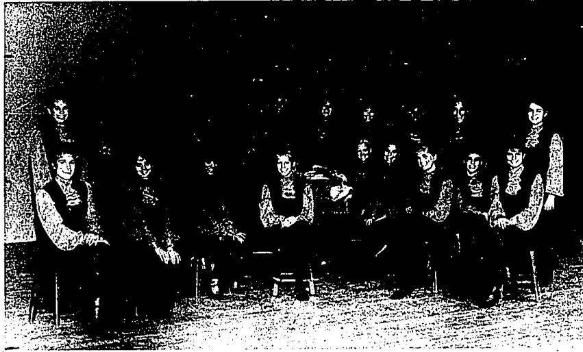
Every year for the past 28 years 20 girls from Mercy High School have been selected by audition to become a Mercyaire. They are singers and dancers, and many play musical instruments to accompany themselves for 60-70 performances every school season. Their audiences may be in country clubs or they may be