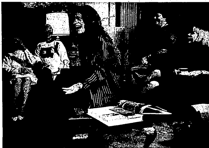
Actress Valerie Bertinelli drew chuckles from members of the 99s when she talked about her flying experiences during the filming of "Pancho Barnes," a made-for-TV movie.