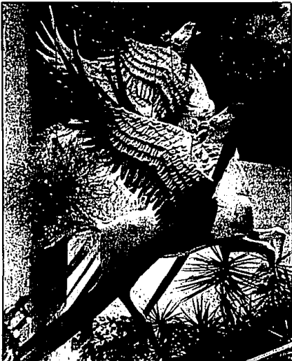
Pegasus horses, with eight-foot wing spans, are suspended from the atrium in the lobby of the Grand Traverse Resort as part of its Northwoods Fantasy Holiday.