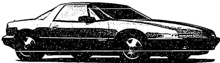
1989 BUICK REATTA

The Buick exhibit at the Auto Show this year is where the Great American Road begins. And it's a show you won't want to miss — because it offers Buick's best.