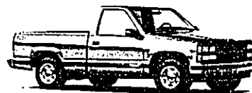
New Full-Size 4x4 Sport