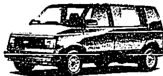
New Astro Sport