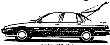
New Corvair LT Hatchback