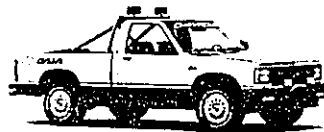
New S-10 Pickup