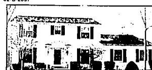
Enjoy the convenience this 4 bedroom FARMINGTON Colonial has to offer with open floor plan, formal dining room, family room with fireplace, 2 1/2 baths, 1st floor laundry, porch and deck. Close to park, shopping and expressways. $154,000 478-5000 07-B-2015