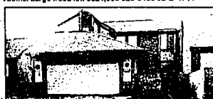
You'll love the convenience this SOUTHFIELD Townhouse has to offer with excellent location, great room, vaulted ceilings, fireplace, 2 bedrooms, 2 1/2 baths, full basement, formal dining room, deck and private enclosed patio. Clubhouse, pool privileges. $169,500 626-9100 02-B-2056