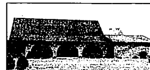
FARMINGTON HILLS. You'll love this Nosan built home with over 3500 SQ. FT. of living space. Two complete master suites, 2 story family room with fireplace, library, central air and one year home warranty. Backs to commons. $218,900 626-9100 02-B-1859