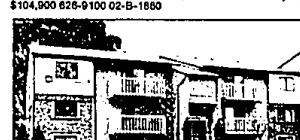
Great location in complex, this FARMINGTON HILLS Condo offers master bedroom, formal dining room, living room, central air, deck plus pool and tennis privileges. Immediate occupancy. $53,000 478-5000 07-A-1807