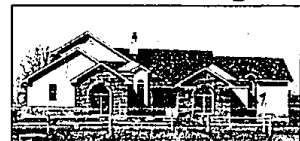
Gracious living in MILFORD on four acre wooded lot with pond. Beautiful Contemporary TUDOR offers cathedral ceilings in great room and master bedroom, family room, 3 bedrooms, 2 1/2 baths, fireplace and porch. Newly constructed builders model. $269,900 478-5000 07-B-0333