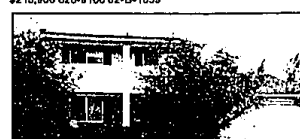
This FARMINGTON HILLS colonial features nicely treed lot, 4 bedrooms, family room with fireplace, updated kitchen, 1st floor laundry, central air, patio and deck. Finished basement plus $1000 toward costs. $116,900 626-9100 02-B-1911