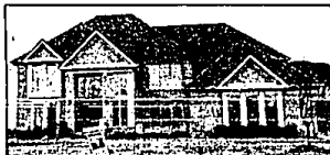
Unique master suite plus indoor atrium makes this 4 bedroom Colonial one of a kind! Tile foyer, family room with fireplace, 1st floor laundry, 2 1/2 baths, deck and 2 car garage. $312,900 626-9100 02-B-2053