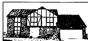
Backing to commons, this lovely 4 bedroom Tudor in FARMINGTON HILLS boasts upgraded features, formal dining room, family room with fireplace, central air, 2 1/2 baths and 2 car attached garage. $219,000 626-9100 02-B-2057