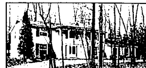
Wooded setting, neutral decor and gourmet kitchen adds to this delightful 4 bedroom Colonial in FARMINGTON HILLS. Library, formal dining room, family room, 2 fireplaces, 2 1/2 baths, patio, deck and attractive landscaping. $215,000 626-9100 02-B-2071