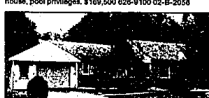
Move right in to this attractive 3 bedroom FARMINGTON HILLS Ranch with 2 full baths, great room, neutral decor, newer carpeting, and multi-level decking. Large wooded lot plus porch and patio. $84,900 478-5000 07-B-1512