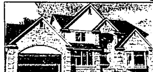
Move right in to this brand new Colonial plus still time to choose your own colors. Ceramic foyer, circular staircase, full wall fireplace and cathedral ceiling enhances this gorgeous home in FARMINGTON HILLS. Immediate Occupancy. $305,550 626-9100 09-B-1754