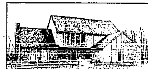
OPEN SAT. & SUN. 1-6, 37468 Glengrove, N. of 13 Mile, W. of Halstead. Quality throughout this former builders model makes this home a wonderful choice. Four bedroom Contemporary with 2 fireplaces, formal dining room, family room, 2 1/2 baths, Berber carpeting, central air and wooded lot. $232,900 626-9100 02-B-1098