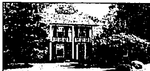
This FARMINGTON HILLS Colonial is full of quality updates with remodeled kitchen, new furnace and deck plus family room with skylight, 2 fireplaces, central air, patio and finished walkout to Inground pool, 2 1/2 baths and 4 bedrooms. Large flood lot. $221,900 626-9100 02-B-1714