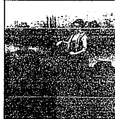
Daniel Ridgway Knight, Oil on Canvas (18" x 24")

Illustrated catalogs available at the gallery for $8.00, postpaid $10.00, express mail and overseas $21.00. Annual subscriptions $50.00. Call or write for a free illustrated brochure.