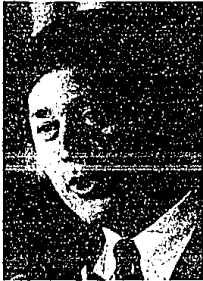
Gov. James Blanchard help small business

The difference: Blanchard advocates literally five dozen programs to promote business; Engler sees