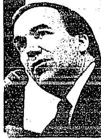
Sen. John Engler hold down costs

The Commerce Department counted "the number of new jobs projected to be created by expansion of companies which had been contacted by the department," a "questionable indicator because the pro-