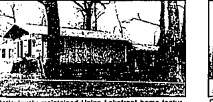
Meticulously maintained Union Lakefront home featuring a newer kitchen, sauna, hot tub, and deck with a high setting for spectacular views. A wet bar, finished walk-out and sandy beach top off a wonderful recreational and comfortable home. 2BDR/2BTH/FR/APL $195,000 478-5000 07-B-2657