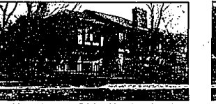
Exquisite contemporary flair is evident throughout this 4 bedroom, 3 1/2 bath WEST BLOOMFIELD home. Backing up to a serene park, this home boasts a cathedral ceiling in great room, large deck off kitchen that has plenty of counter space. Too much to list! $354,000 628-9100 02-B-2668