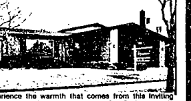
Experience the warmth that comes from this inviting home located in DEARBORN HEIGHTS. Impeccably maintained, this 4 bedroom home boasts a charming kitchen with custom oak cabinets, dining room with doorwall leading to patio, F.R. with fireplace. Never carpeting, roof and furnace. $147,900 478-5000 07-D-2362