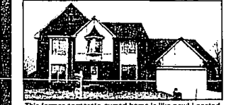
This former corporate-owned home is like new! Located in the popular Meadowbrook Park subdivision in FARMINGTON HILLS, this home features 4 bedrooms, 2 1/2 baths, custom light fixtures, Jennair range plus 2 ovens, large deck and excellent landscaping. $225,900 478-5000 07-B-2676