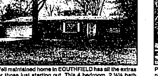
Well maintained home in SOUTHFIELD has all the extras for those just starting out. This 4 bedroom, 2 1/2 bath ranch offers a spacious den, dining room, breakfast nook, and woodburning fireplace. Some appliances included, plus many amenities! $95,500 478-5000 07-A-2357