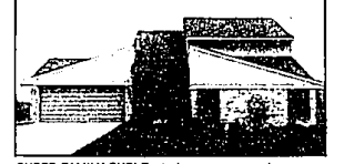
OPEN SUNDAY 2-5 SUPER FAMILY SUB! Featuring an open contemporary design with a dramatic 2-story foyer, oak and formica kitchen, 3 large bedrooms, 2 1/2 baths, first floor laundry and a deck with a super view of commons area and pond. $167,000 628-9100 02-A-2682