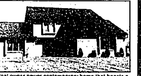
Original owner never contemporary home that boasts a complete list of desirable extras! Features include ceramic tile entrance around curved wall, marble enclosed fireplace in Great Room with cathedral ceilings, 4 bedrooms, 2 1/2 baths, raised dining room, tiled deck and much more! $189,900 628-9100 02-B-2488