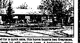
Priced for a quick sale, this home boasts two fireplaces, nice large lot with mature trees, 4 bedrooms, dining room, breakfast nook, hardwood floors, and a spacious screened porch provides much relaxation space. Many extras! $89,000 628-9100 02-A-2684