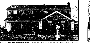
Sharp FARMINGTON HILLS home has a family room with full brick wall and fireplace, doorways from kitchen and family room leads to multi-level deck that overlooks pond and commons. 4BDR/2.5BTH/DR/FR/BN $185,700 851-8100 06-B-2851