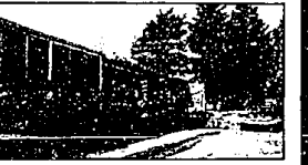
This dynamite contemporary ranch is situated on a large wooded lot in BLOOMFIELD HILLS. An inground pool - rotted in '88 - is highlighted by a screened porch and patio, stone floor in foyer and gorgeous fireplace in great room make this home truly exceptional. 3BDR/2 1/2BTH/FR/APL/CA $299,000 628-9100 02-B-2870