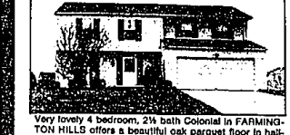
Very lovely 4 bedroom, 2 1/2 bath Colonial in FARMINGTON HILLS offers a beautiful oak parquet floor in hallway and kitchen, dining room, breakfast nook, spacious master bedroom with large bath, nice large deck, central air and premium location near main arteries. $143,600 628-9100 02-A-2685