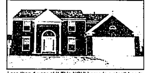
Less than 1 year old! This NOVI home is a stunner! Loads of features including a 2-story foyer, country kitchen, hardwood floors, 2-way fireplace, master bedroom with jacuzzi, full basement, first floor laundry, deck and the list goes on and on! $209,000 478-5000 07-B-2879