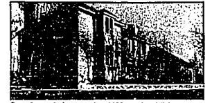
Over 3 wooded acres plus 4400 sq. ft. of living space enhances this spectacular country French home with 2 story foyer, island kitchen, music room, office, and patio. This 4 bedroom, 3 1/2 bath home is incredible! the makings of a dream home. DR/CA. $518,000 628-9100 02-B-2155