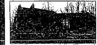
STUNNING contemporary overlooking 11th green of Orchard Lk. Country Club. This home offers over 1 acre of private wooded setting with superior landscaping, beautiful 2 story entry, great room with fireplace, deck, central air and so much more! $550,000 478-5000 07-B-2072