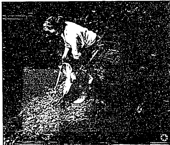
Mulch saves water, keeps weeds down and gives landscaped areas a professional, finished look.

4. Salt hay and straw: Not as attractive as bark or chips, but great for the vegetable garden, salt hay and straw