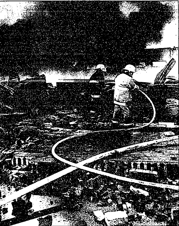
Firefighters stand on the collapsed west wall of Novi American plastics on Grand River. Smoke could be seen in western Farmington Hills all Wednesday morning.