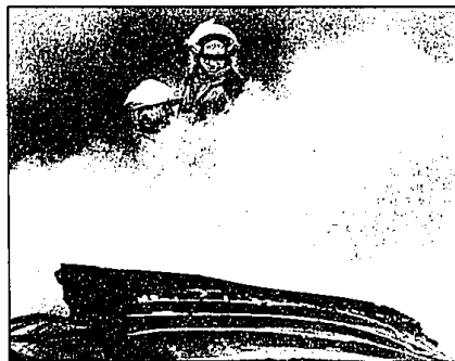
Blowing smoke engulfs firefighters as they watch for piles of plastic to flame up.